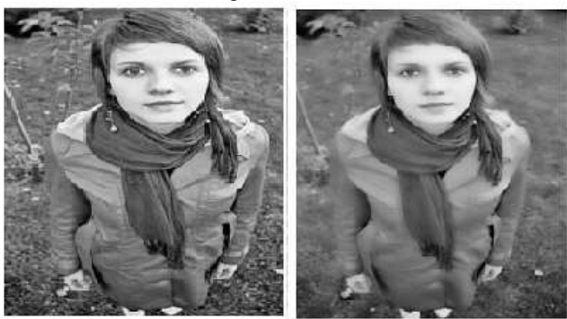
Fig2(a) original image (b) result of bilateral filtering [13]

Fig 2(a) shows the original image fig 2(b) shows the denoised version of noisy image by using the concept of bilateral filtering