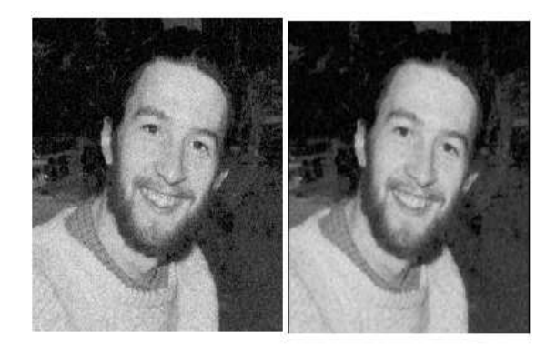
Fig 3(a) noisy image (b) result of median filtering [14] Fig 3(a) shows the noisy image that is affected by the gaussian noise.fig 3(b) shows the denoised version of previous noisy image. Image is denoised by using the concept of median filtering.

a) Less effective in removing gaussian or random-intensity noise. The median filter can remove noise only if the noisy pixels occupy less than one half of the neighborhood area.