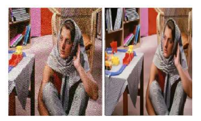
Fig 4(a) noisy image (b) result of non local means [15] Fig 4(a) shows the noisy image that is affected by the gaussian noise.fig 4(b) shows the denoised version of previous noisy image. Image is denoised by using the concept of non local means.